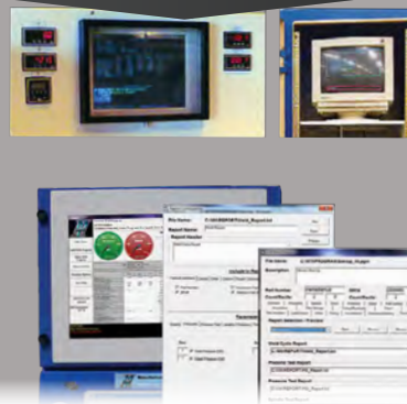
Reports are Traceable and Portable

Updated safety circuit designed around today's safety codes.