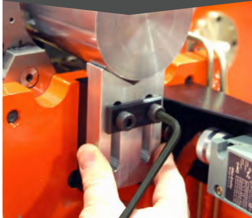
Steady Rest Adjustments