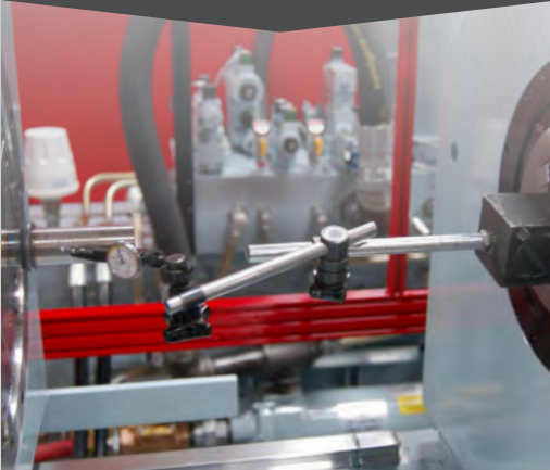
Spindle Alignment Verification